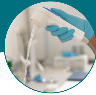
Unique BIOPURE Water Dispensing Gun

A fundamental element of designing or upgrading an LDU (Local Decontamination Unit) is ensuring continuous compliance with decontamination standards. Careful consideration needs to be given to the sourcing and positioning of decontamination equipment such as washer disinfectors, sterilisers and water purification systems. ELGA Process Water can provide the best advice, service and equipment to help you meet the latest standards and achieve the most cost-effective solution for your practice.